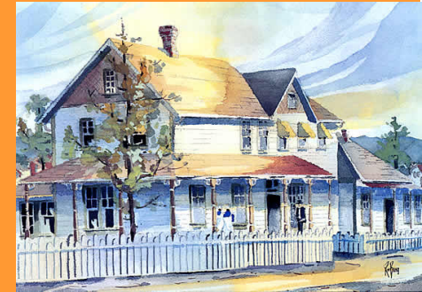
The Cottage Hospital The Artist—Rick Bond The first Vernon Jubilee Hospital opened to patients in late 1897.

2101 - 32nd Street Vernon, BC V1T 5L2 Phone: 250-558-1362 Fax: 250-558-4133 E-mail: info@vjhfoundation.org Website: www.vjhfoundation.org