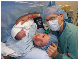
The Fisher Family

For more information call 250-558-1362 or visit our website @www.vjhfoundation.org